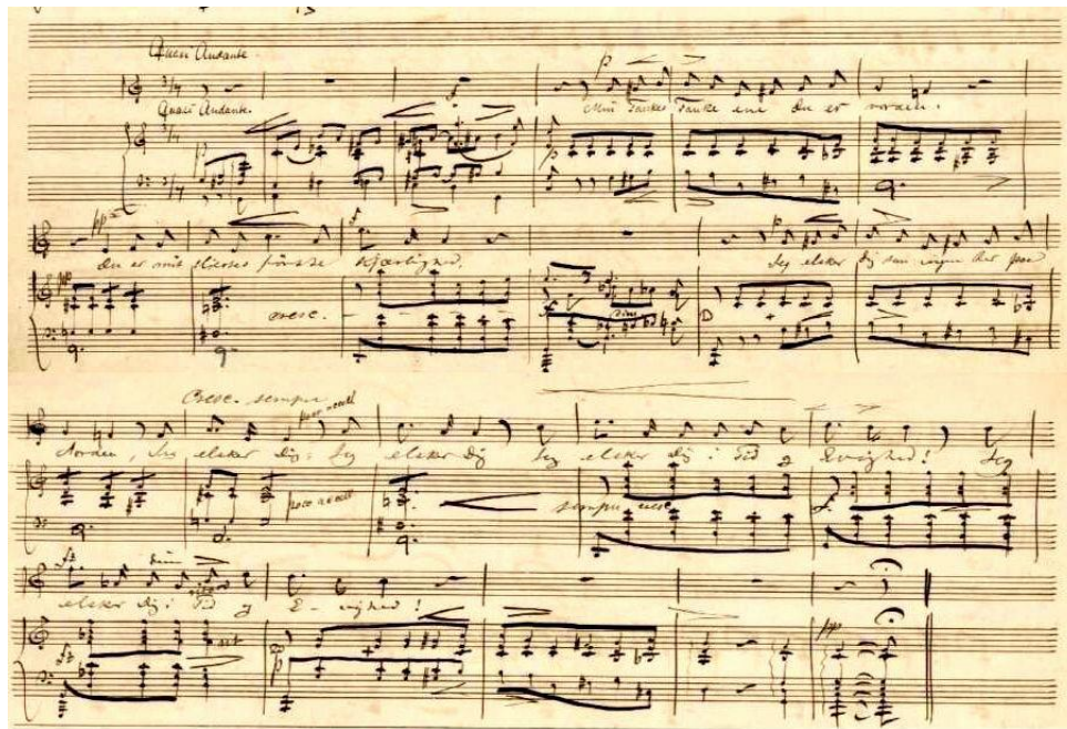
Manuscript for Jeg Elsker Dig (I Love Thee) by Edvard Grieg, December 1864.