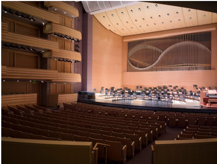
Overture Hall, site of Sangerfest 2010's Grand Concert

rich, true sound throughout, reaching even to the back balcony. Perhaps the most dramatic aspect of the Hall is the concert organ that serves as the backdrop to the performance stage. Built in Germany by the firm of Orgelbau Klais Bonn, the 174-ton Overture Concert Organ with its 4,040 pipes is conveyed on railroad tracks to its storage space at the back of the stage when not in use. It is believed to be the heaviest movable object in any theater in the world.