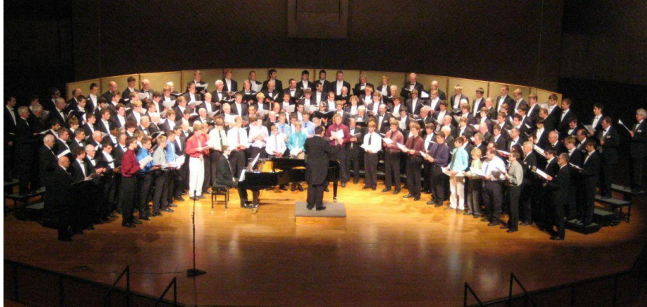
May 6, Luren with Norsemen

On June 7 th , we head to LaCrosse WI for a concert at Our Savior's Lutheran Church, where the Wergeland Lodge of Sons of Norway