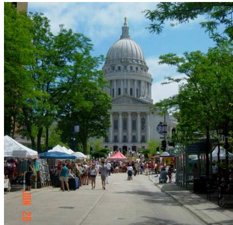
View of Wisconsin State Capitol with Farmers Market June 26, 2010, the morning of the Grand Concert.