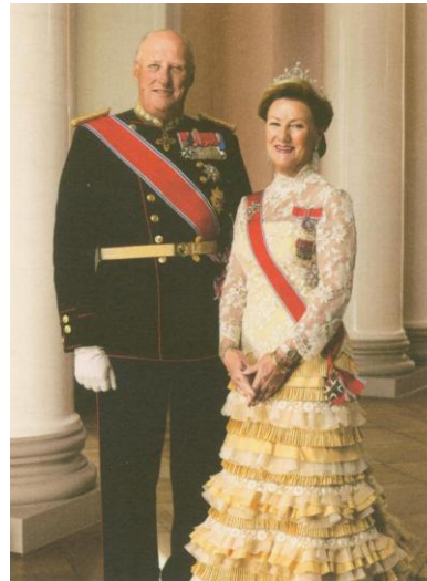
Luren sings by Vesterheim for the royal couple. King Harald V and Queen Sonja