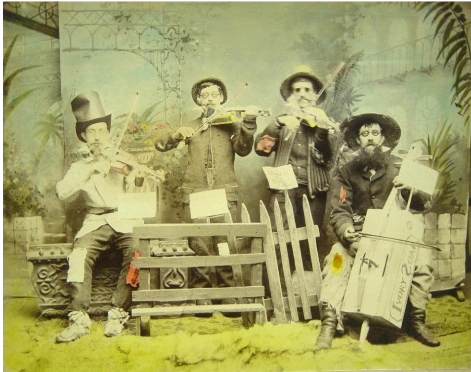
Skurrekvartten i Luren.