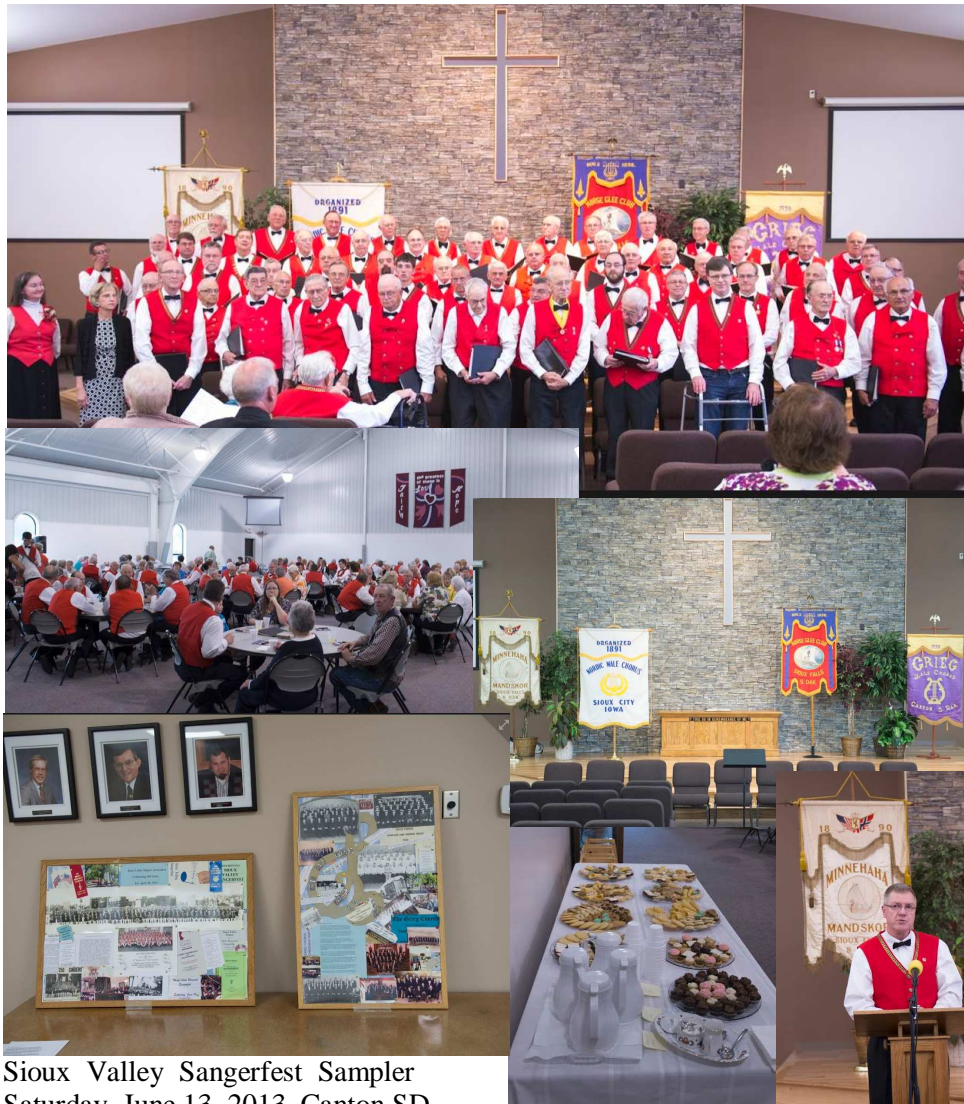
Sioux Valley Sangerfest Sampler Saturday, June 13, 2013, Canton SD.