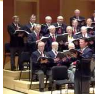
PCNSA Sangerfest 2013

celebrate the Scandinavian heritage and honor the singers' brotherhood. The event allowed all who attended to experience the pleasures of song, the fond remembrance of country and homeland, and the joy of fellowship in music.