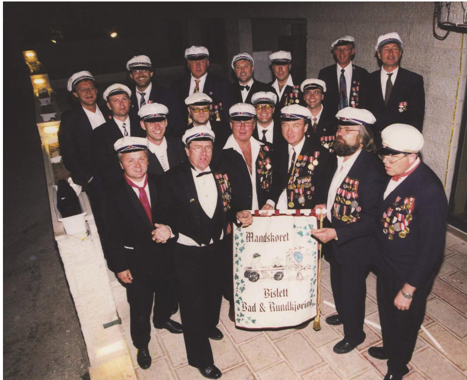
Mandskoret Bislett Bad & Rundkjøring from Oslo, Norway.

The above chorus from Oslo will be singing during the 2014 Sangerfest in Minneapolis. Their name is very tongue in cheek as they are named after a traffic intersection in central Oslo. (See page 16 for more details about this intersection.) It is an ensemble of like-minded and light hearted businessmen who also perform informally at events abroad. The choir has been featured as far afield as Houston, London, Singapore, New York, and Florida. Their repertoire ranges from sea shanties to Elvis. Note that they are highly decorated!