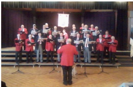
Combined Harmony and Sveas Söner Choruses.

Harmony Singing Society and Sveas Söner Chorus joined to perform a concert May 24th at Bethesda Covenant Church in Rockford. Each chorus sang individual numbers and both choruses joined together to perform a number of songs. Midway through the concert the Rock Valley Children's Choir entertained us.