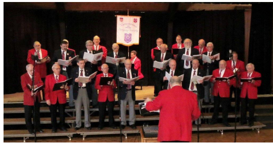
Harmony and Normennenes combined choruses.