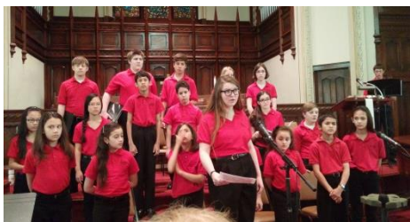
Rockford Valley Children's Choir.

Harmony Singing Society was formed in 1923. This is a special year for the Sveas Söner Chorus. They were formed in 1890; so this is their 125th Anniversary! To celebrate we had a sheet cake and cookies for all. Many in the audience joined us. Many chorus members and spouses then went out for supper.