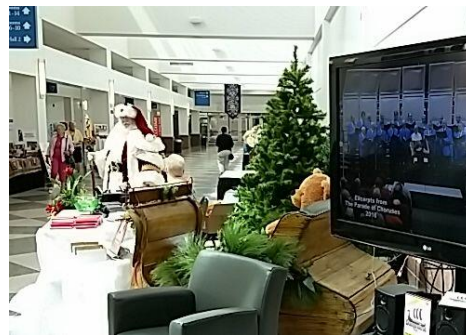
Santa Claus at the DVD booth.