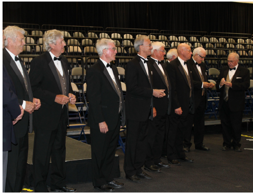
The Luren first time attendees and some of the medal winners during Parade of Choruses.