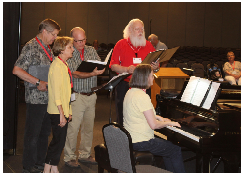
The Sioux Valley Singers directors sang a song of welcome to begin the 2016 Sangerfest opening rehearsal.

The most recent NSAA Sangerfest, in Sioux Falls, hosted by Sioux Valley