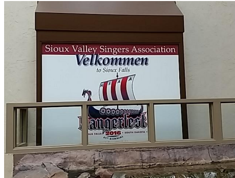
Velkommen at the hotel.

Our next Harmony rehearsal is the second Tuesday of September. Our club is having their last steak dinner of the season the third Wednesday of September. I will take pictures of our club house and submit for the next issue. We already have engagements to sing twice during Sept. Have a great singing season!