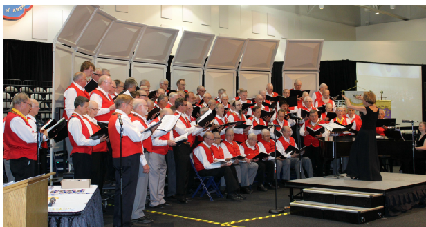
Sioux Valley Singers lead off the Parade of Choruses program.