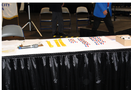
Fest 2016 table with some of the medals.