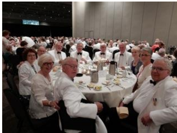
Some of the Edvard Grieg Chorus at the Grand Banquet 10 June 2016.

three grants. Our Chorus essentially broke even for the year, and as a result, no funds had to be drawn from our reserves to cover our operational expenses.