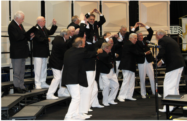
Bjornson Male Chorus in the Parade of Choruses singing Johnnie Schmoker.

In March we had only one date and that was at the annual Festival Of Songs at Normennenes' club house in Lincolnshire on Friday