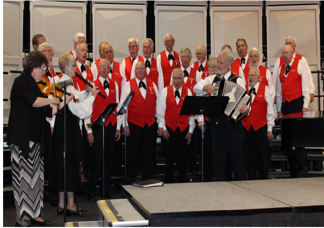
Edvard Grieg Chorus sings Dansen på Måkeskjær in Parade of Choruses.

membership dues to $100, gave our staff long overdue raises, reduced rent and other expenses, increased performance revenues, and secured