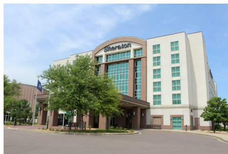
Sioux Falls 2016 Sangerfest Hotel.