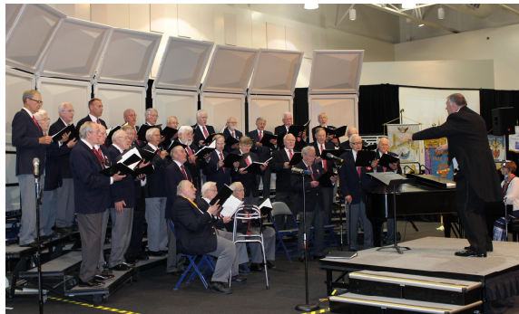
Norwegian Glee Club sings in the Parade of Choruses program.