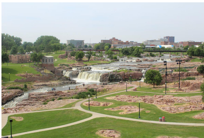
Beautiful Sioux Falls.