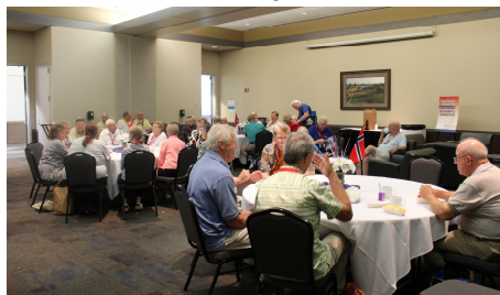
SF 2016 Sangerfest hospitality room.