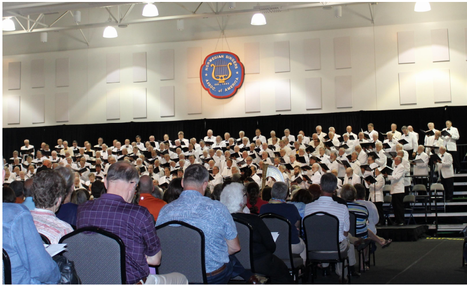
NSAA Sangerfest Grand Concert, 11 June 2016.