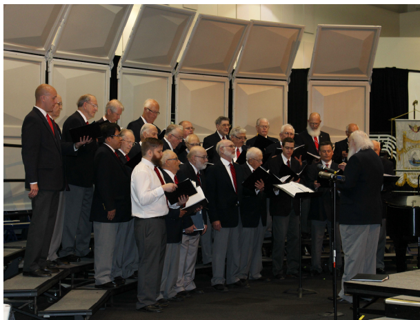
Norse Glee Club sings in Parade of Choruses.

Sangerfest 2016 is now in our performance history books. The Norse Glee Club feels privileged to have been part of the Sioux Valley Singers Association (SVSA) team of choruses and auxiliaries that played host to this year's Sioux Falls event. Collectively, we hope that the experience met or exceeded the attendees' expectations. The powerful performances seen during the Parade of Choruses and the Grand Concert were certainly reflective of significant preparation by