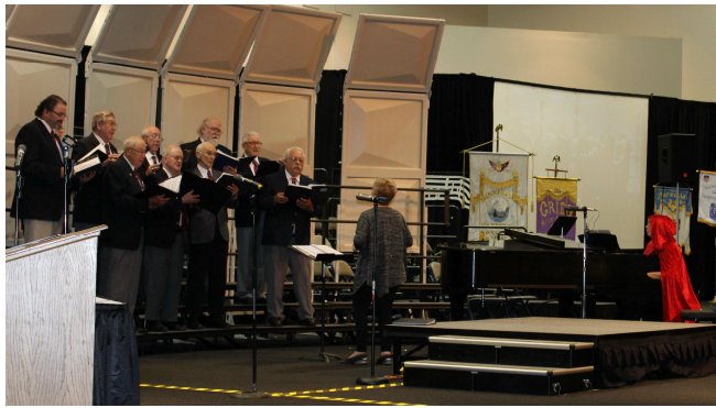
Harmony Singing Society performing Lil' Red Riding Hood in Parade of Choruses.