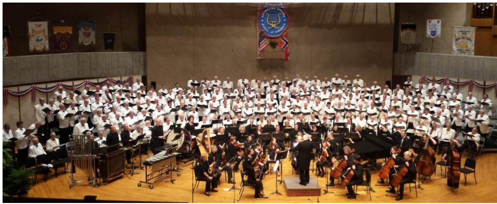
NSAA Sangerfest 2018 Grand Concert, held in the Center for Faith and Life at Luther College, Saturday 2 June 2018 in Decorah IA.