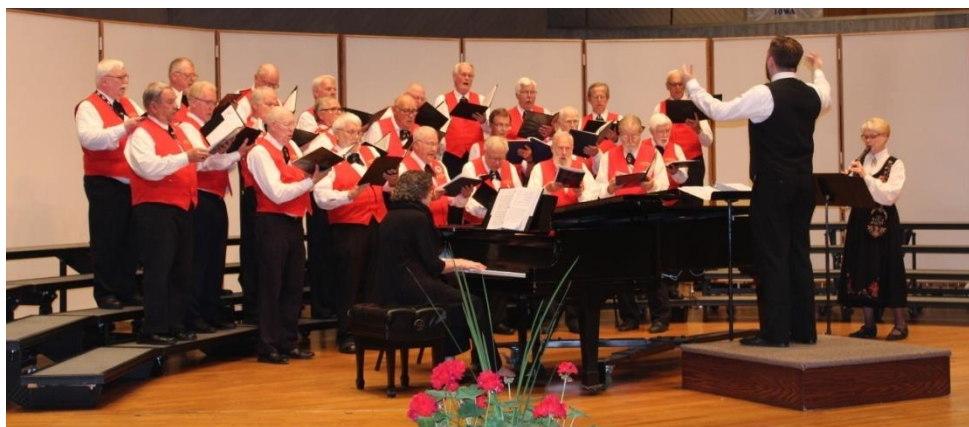
Madison Edvard Grieg Chorus sings at Parade of Choruses.