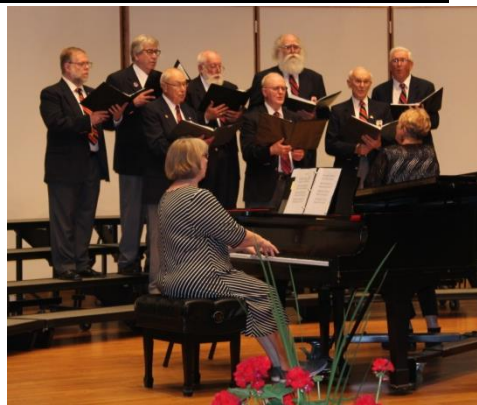
Rockford Harmony Chorus sings at the Parade of Choruses.