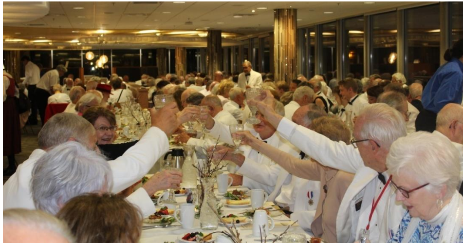
Skål at the Grand Concert Afterglow.