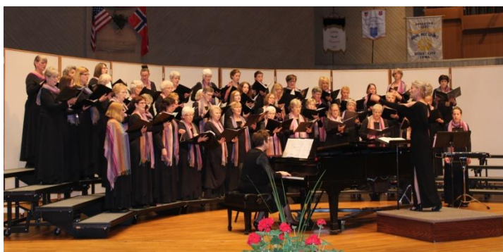
Decorah's Northern Lights Chorus sings at Parade of Choruses.