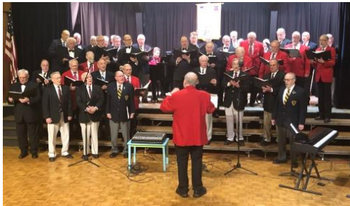
The Grand Chorus at the 39 th Annual Festival of Song.

The program was complete with a Grand Chorus presentation of five songs.