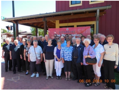
Luren Singers in front of the Livsreise Museum in Stoughton WI.