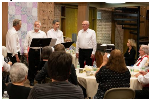
The Gospel Gold quartet.