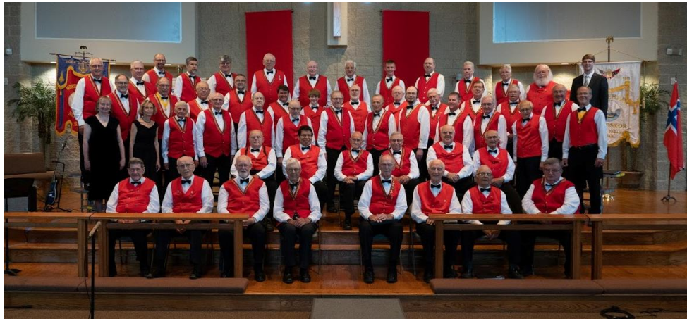
51 st biennial Sioux Valley Sangerfest chorus, 8 June 2019 at Brandon Lutheran Church.