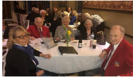
.Socializing at Festival of Song.

catching up with our guests, sharing their stories and many memories.