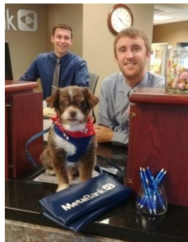
Mandskor mascot Winston is depositing money from sales at the Chislic concession stand.

The effort reaped record sales this year from the very start. This is the 8 th year of Fair participation by the Mandskor. For more coverage, visit our Facebook page.