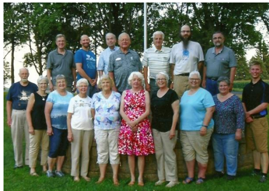
Grieg Male Chorus picnic at Moe Parish Park, Prayer Garden.

During our summer break we gathered on Aug. 12 th to enjoy our annual Grieg chorus picnic. Once again we assembled at the Moe Parish Park, Hudson SD. Our picnic photo was taken at a beautiful new addition to the park, the Prayer Garden. As with any potluck event, there was a bounty of delicious food to enjoy. Keeping with tradition, after the meal, each person shared highlights of family the summer.