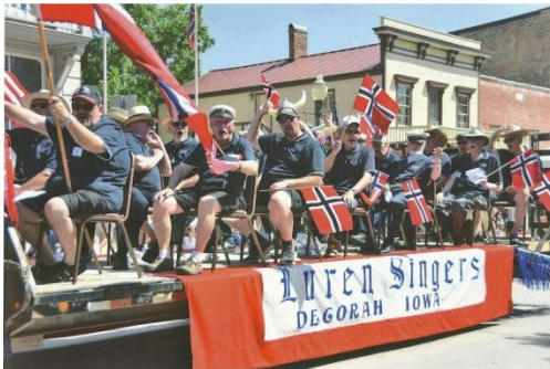
Luren Singers sing on their 2019 Nordic Fest float.

Again this year members of the Luren Singers sang on a float in the Nordic Fest parade, on Saturday, July 27.