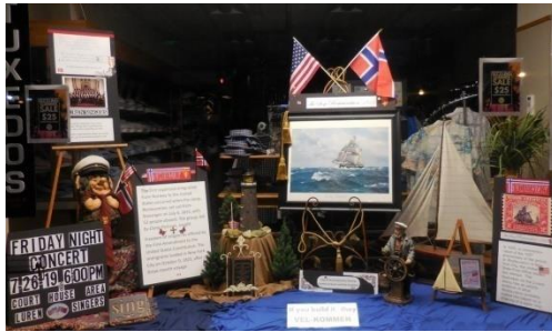
Luren window at 2019 Nordic Fest.