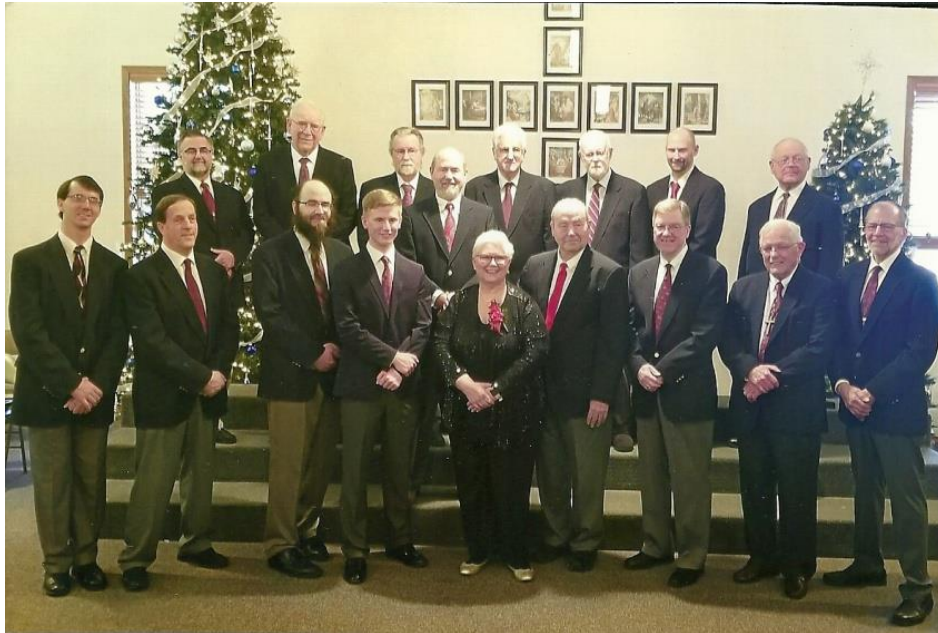
Grieg Male Chorus of Canton at the Twelfth Day of Christmas Concert on 5 January, 2020.