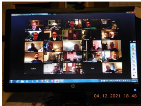
Luren Zoom rehearsal of April 12, 2021.

We began 2021 with a Zoom rehearsal on Jan. 25, and then followed with two Zoom rehearsals each month in February, March and April.