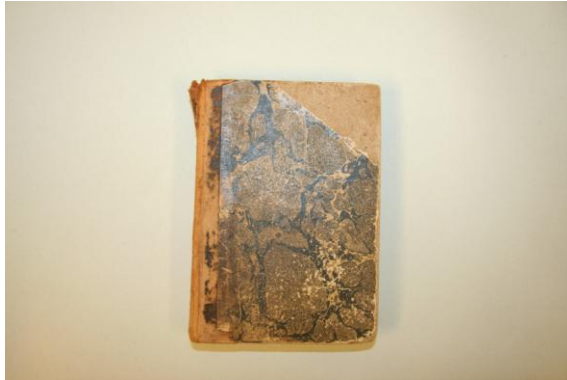
Cover of the Luren song book (1874)