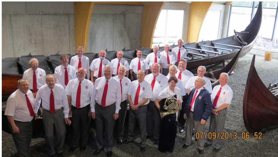
PCNSA Norway Tour Chorus of 2013 at the Viking Ship Museum on Bygdøy, outside of Oslo. The accompanist Jean Malmin is not in the picture.