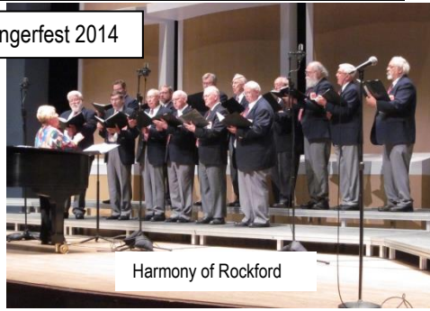
Harmony of Rockford