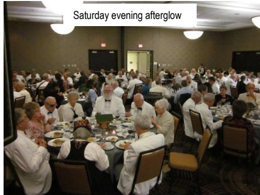
Saturday evening afterglow