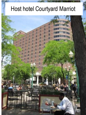
Host hotel Courtyard Marriot