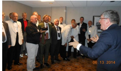
Bislett chorus joined by NSAA folks at the Norwegian Hon. Consulate General reception, 12 June 2014.