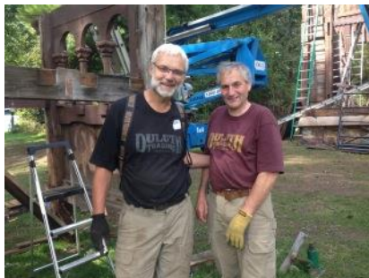
Two of the 10 men and 3 women who came from Orkdal for the project.