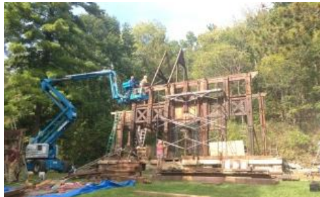
Disassembly of 1893 stave church at Little Norway near Mt. Horeb WI.