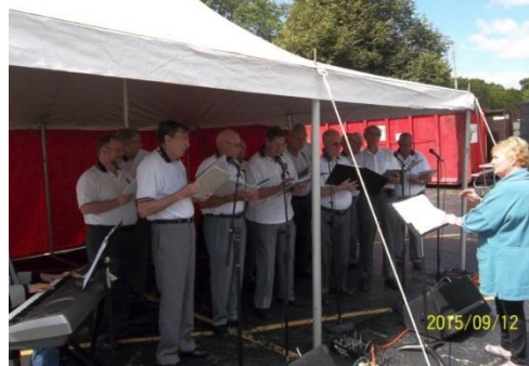
Harmony sings at Alley Walk event.

We sang around twelve numbers. Lil' Red Riding Hood and Turn Around, Look at Me are very well received by the audiences!