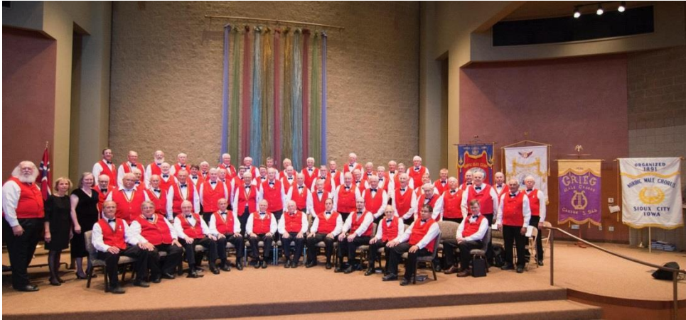
Sioux Valley Singers Association at 50 th Sangerfest, 10 June 2017 at Spirit of Peace UCC Church, Sioux Falls SD.