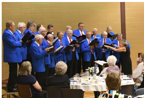
Mandskor sings at Sons of Norway Syttende Mai Banquet.

May 8 th we hosted a combined rehearsal of the Sioux Valley Singers. May 16 th we performed at the annual Sons of Norway Syttende Mai Banquet. The event took place in the Reformation Hall at First Lutheran Church.