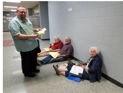
Hospitality Committee in hallway.

We might get a ðbreakö until we get back together in mid-September. In the meantime, the Sangerfest 2018 committees are holding their meetings, with the Steering Committee coordinating the plans. The Hospitality Committee was holding a meeting at the Decorah Middle School when a tornado warning forced them to move to the school hallway!