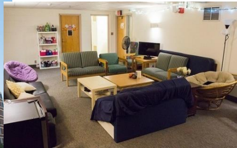
The commons area for a room cluster in Farwell Hall.