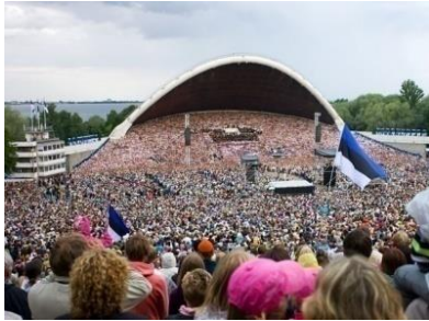
Folk Festival Chorus at bandshell in Talinn, Estonia.