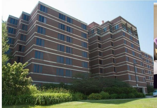
Farwell Hall on Luther College campus.