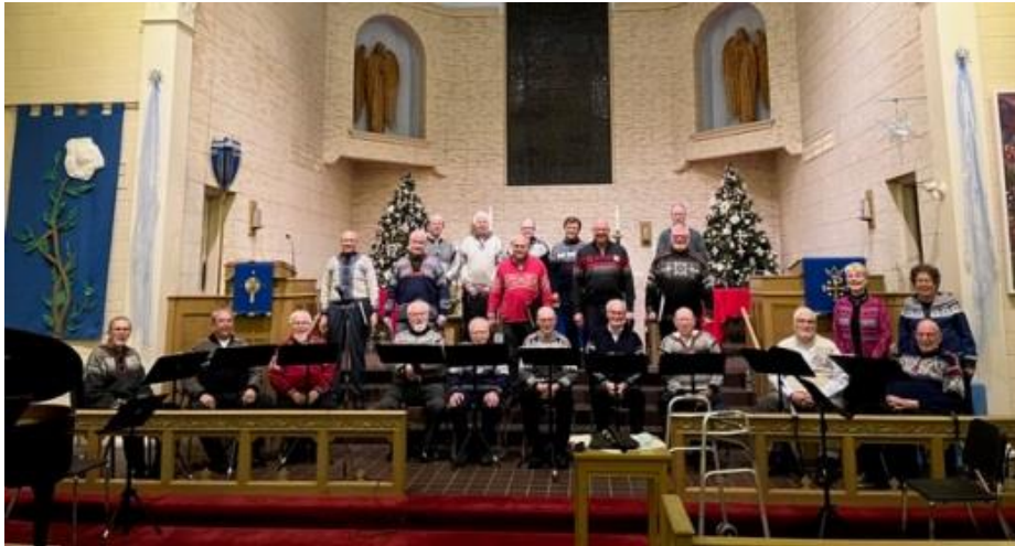
Edvard Greig Christmas party.

We had a beautiful day and a great turnout for the event. Three months had passed since we were all together for Sangerfest so there was a lot of chatter and catching up among the members. Our membership this year has slipped to 33 singers with 30 active and 3 inactive.