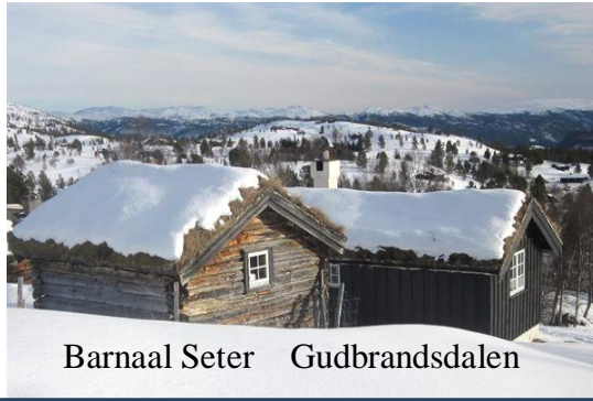
Barnaal Seter Gudbrandsdalen