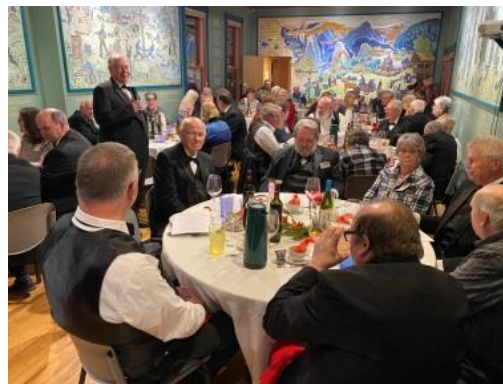
Luren dinner at Giants of the Earth, Spring Grove MN, Feb. 27, 2023